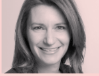
Lucy Frazer QC Conservative Parliamentary Candidate