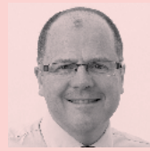
George Freeman MP Minister for Life Sciences

A lifelong Eurosceptic he joined UKIP and is now standing as the UKIP candidate for Police and Crime Commissioner for Cambridgeshire and is a regular spokesman for UKIP.